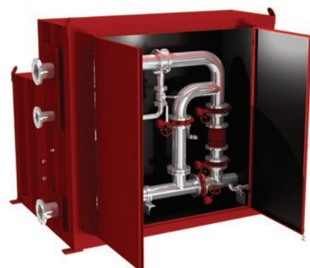
Deluge, Single Zone

Every system can be customized, upon request, for compliance with applicable rules, regulations and project specific requirements. Full documentation for any tailor-made products are available and include all necessary certifications, third party verifications such as DNV/GL, BV, ABS, etc., and full scale test reports, if required.